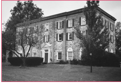
The campaign and renovations have been the largest and most significant event for Kappa Chapter since the house was built in 1926.

Now is the time to make that investment in the future of Kappa Chapter and the many young brothers yet to be. This will assure the learning and brotherhood for many decades to come unlike the several chapters that have closed at Penn State in the past few years. Many of you have already contributed to the campaign. We thank you for your generosity and support. But we are not out of the financial woods yet. With a loan in excess of $900,000 and a changing interest rate every five years, we must take every precaution to protect the financial stability of